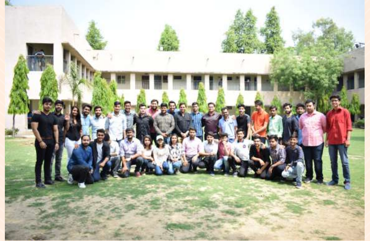
B.COM HONS. SECTION B