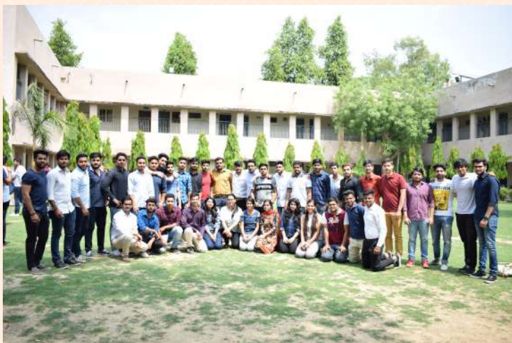
B.COM SECTION C