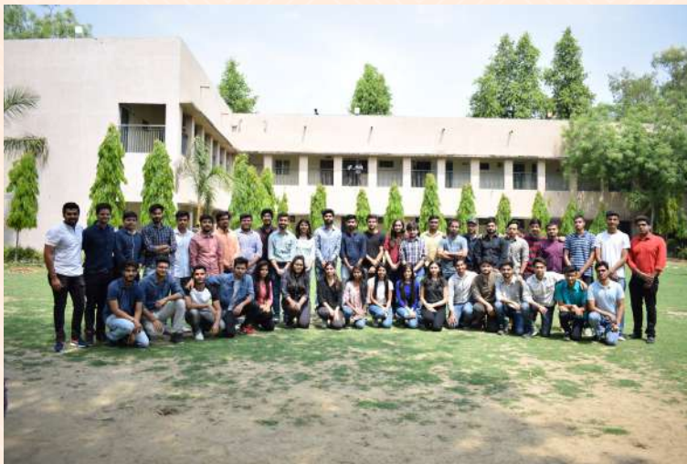
B.COM SECTION A