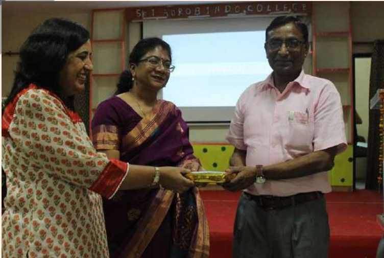
Service from 21/09/1974 to 21/08/2017