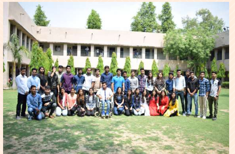
B.COM SECTION D