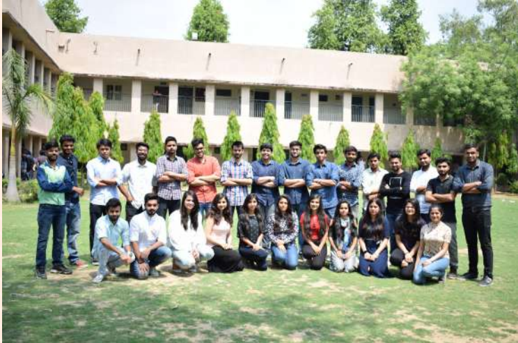
B.COM HONS. SECTION A