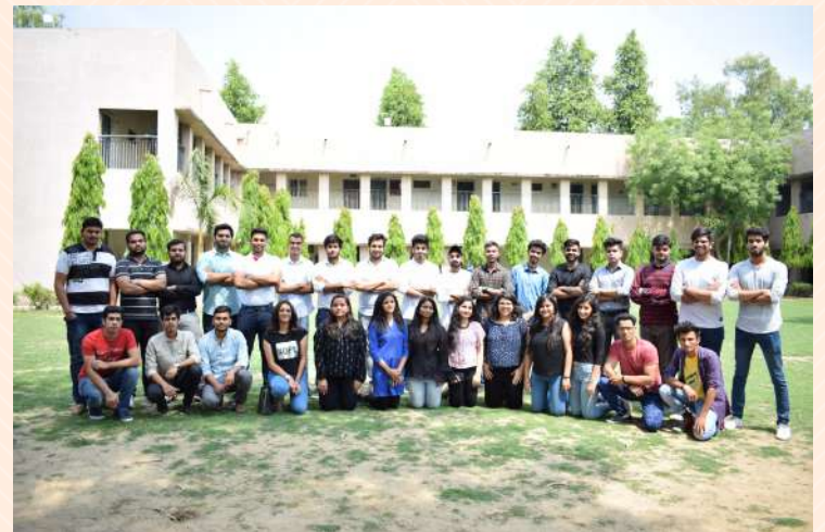
B.COM SECTION B