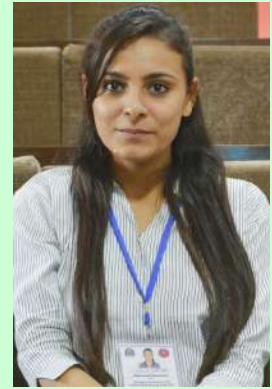
/ BY NIKITA NARAYANI B.COM (P) 2ND YEAR

11) Saubhagya Yojna: The government has targeted to increase the number of power connections in rural areas to 40 million households. This scheme is one of PM Modi's ambitious plan.