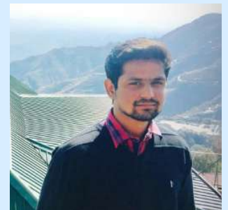
/BY HARSH GOYAL B.COM (H) 3RD YEAR

Currently India faces a challenge from countries such as Vietnam, Bangladesh, Thailand, Congo where cheaper labour is available and also from global innovators such as US, Japan, Germany. This pressure coupled with factors such as low R&D expenditure (mere 0.6% of GDP), impeded